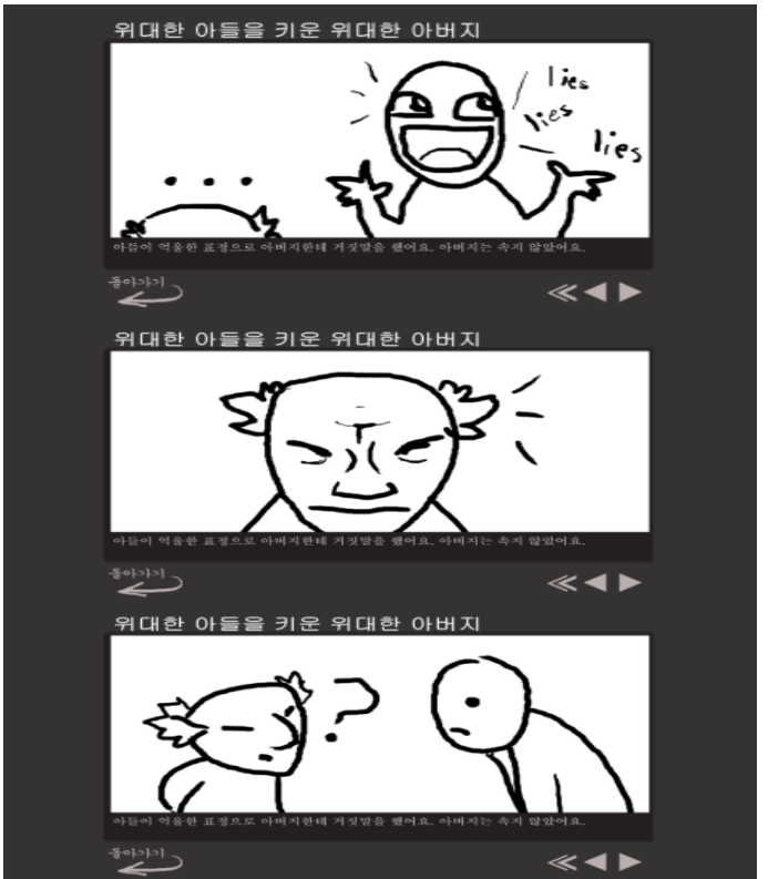
Figure 1. Linear representation of one animated scene from Jenny's multimodal reading response. The images from top to bottom changed for animation effects. The linguistic text on the top of the visual, "위대한 아들을 키운 위대한 아버지" [A great father who raised a great son], was the title of the story and the text below the visual is the linguistic explanation of the story, "아들이 억울한 표정으로 아버지한테 거짓말을 했어요. 아버지는 속지 않았어요" [The son lied to his father with a hurt face. The father was not deceived].

represented the content in more sophisticated ways using visual, a non-linguistic mode, I describe one scene from the movie in detail that included three animated images accompanying the linguistic text, "아들이 억울한 표정으로 아버지한테 거짓말을 했어요. 아버지는 속지 않았어요" [The son lied to his father with a hurt face. The father was not deceived]. See figure 1 below: