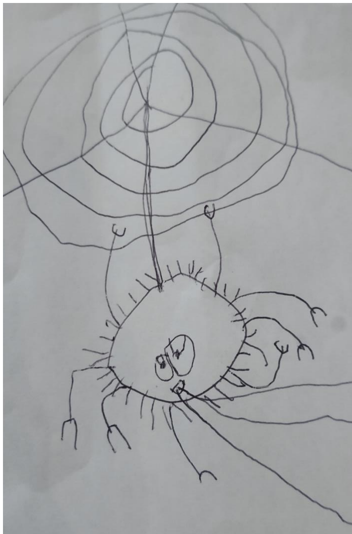
Stanley The Spider by Aiden