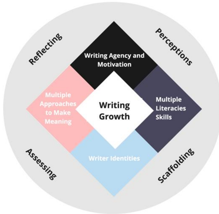
Figure 2 How Multimodal Writing Activities Support Writing

and needs for individualized scaffolding and differentiated instruction, which often leads to a new understanding of students. Although there are some concerns, it is still worthwhile to take the risk for the positive learning experiences of our multilingual learners.